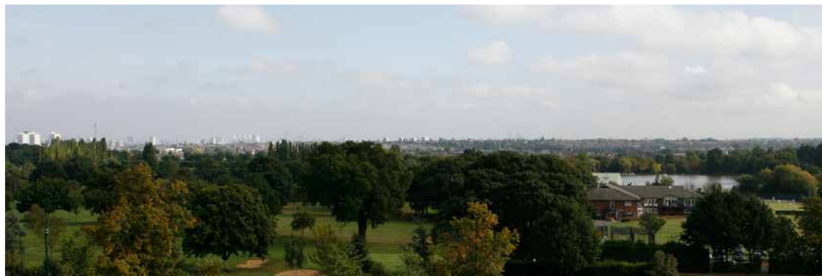
the view from The Roof Top bar

The Roof Top bar is an open terrace bar on top of Centre Court stadium with spectacular views of the outside courts and the golf course. Debenture holders can enjoy platters of seafood and antipasti, fine wines, Pimm's and premium bottled beers while enjoying the fresh air.