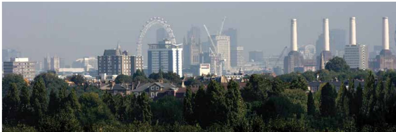
the view from The Gallery lounge & bar

The Gallery lounge & bar provides wonderful views over the outside courts and the London skyline and has been designed for debenture holders to enjoy a great selection of drinks in an elegant setting.