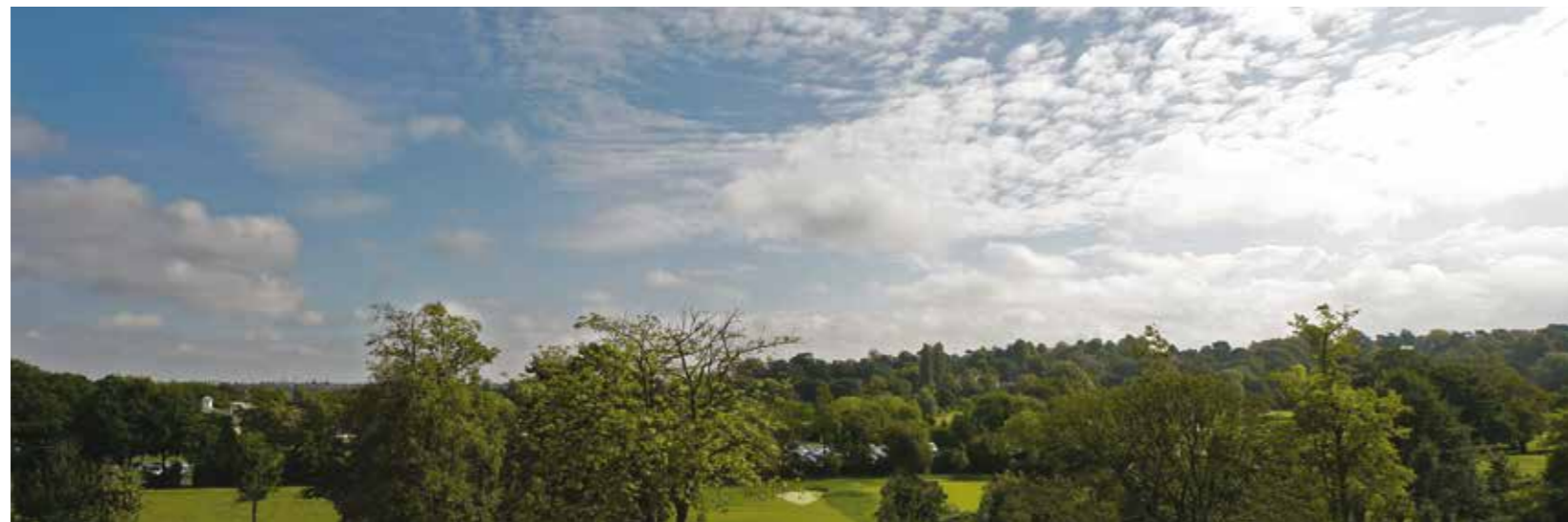
the view from The Terrace restaurant

The Terrace self-service restaurant provides debenture holders with high quality food and beverages throughout the day and is an ideal location for a quick lunch or afternoon tea while enjoying the wonderful view from the balcony looking out over the Tea Lawn. Light refreshments will be available from 10.30 a.m. and lunch from 11.00 a.m. It will not be possible to make reservations but the restaurant is designed to allow for maximum throughput at peak times.