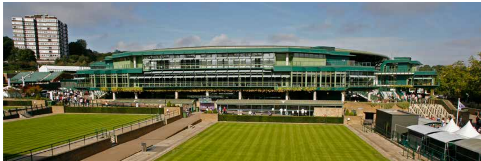
the view from The Courtside restaurant

The Courtside restaurant is the premier waiter-served restaurant offering debenture holders a wide range of hot and cold three-course lunches and traditional Wimbledon afternoon tea. The wines on offer have been specially selected by our Official Wine Supplier to enhance your dining experience. The restaurant features showcases displaying memorable objects and images from Wimbledon history. Reservations can be made for a maximum of six persons per table.