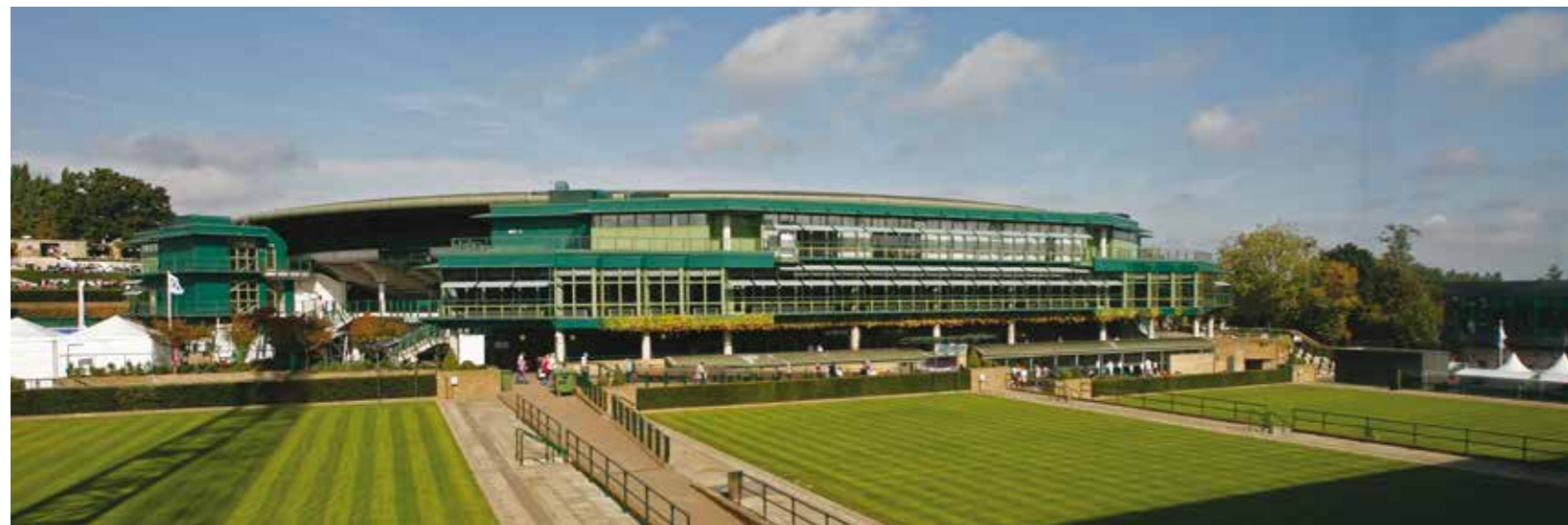
the view from The Champagne Bar

The Champagne Bar has been beautifully refurbished and will enable debenture holders to enjoy a glass of Champagne or wine in the bar which is adjacent to The Courtside restaurant and an ideal place to wait for guests. Debenture holders can enjoy a light lunch in the bar with an exceptional selection of seafood.