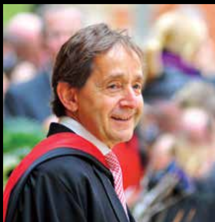
Dr Anthony Seldon